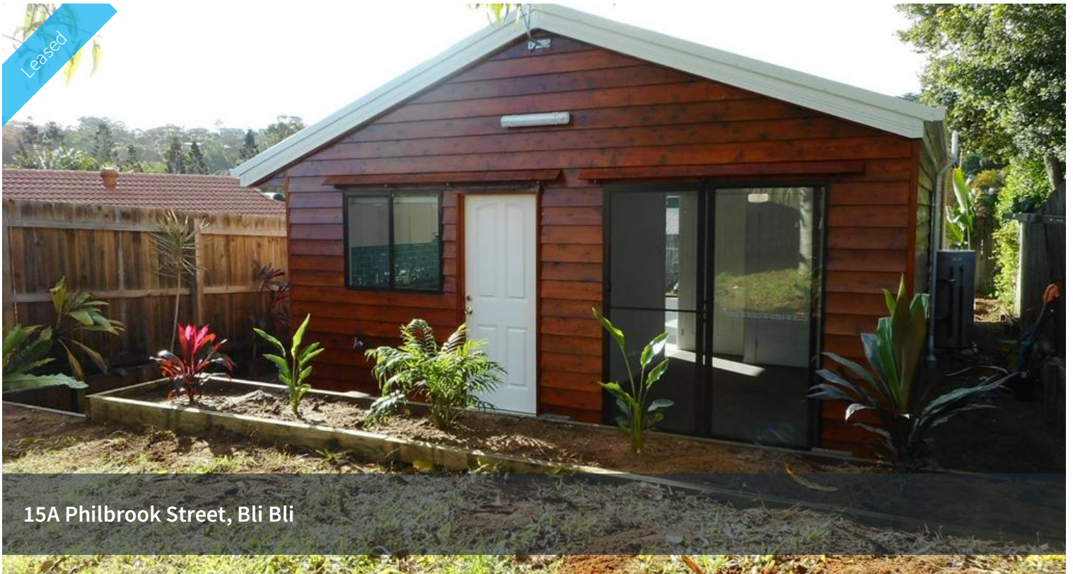
15A Philbrook Street, Bli Bli