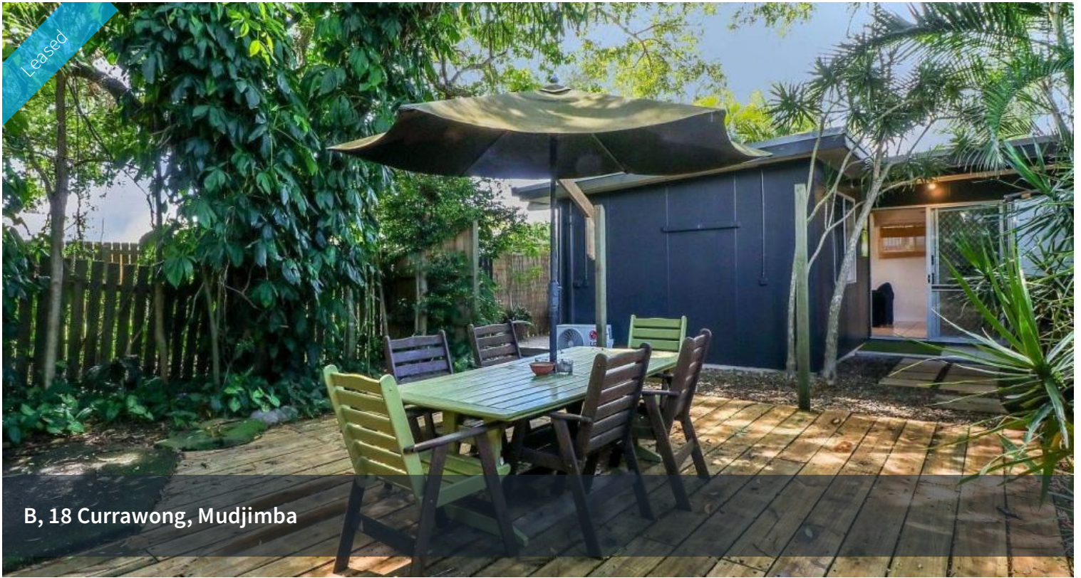
B, 18 Currawong, Mudjimba