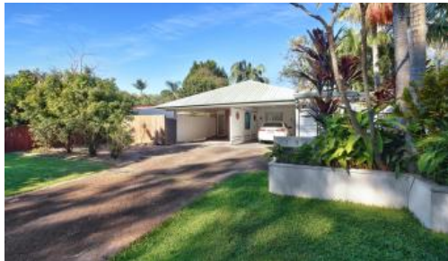
Unit 1, 9 Gayome St, Pacific Paradise