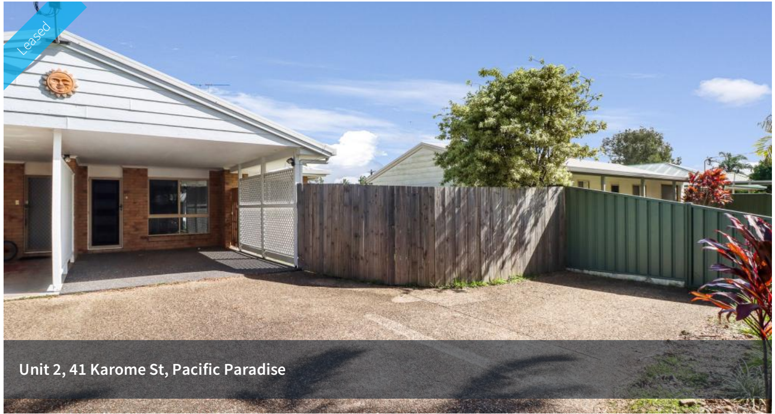
Unit 2, 41 Karome St, Pacific Paradise