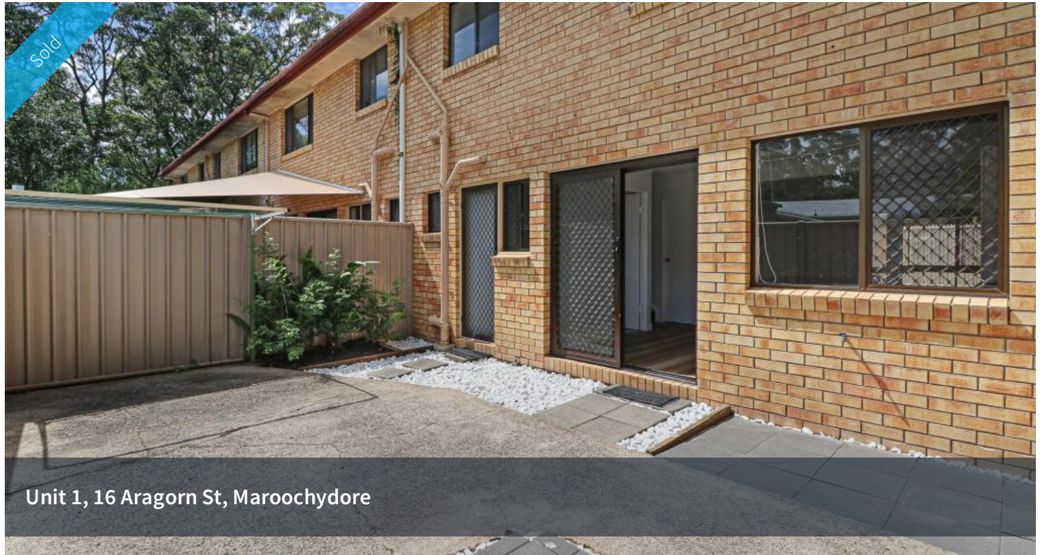
Unit 1, 16 Aragorn St, Maroochydore