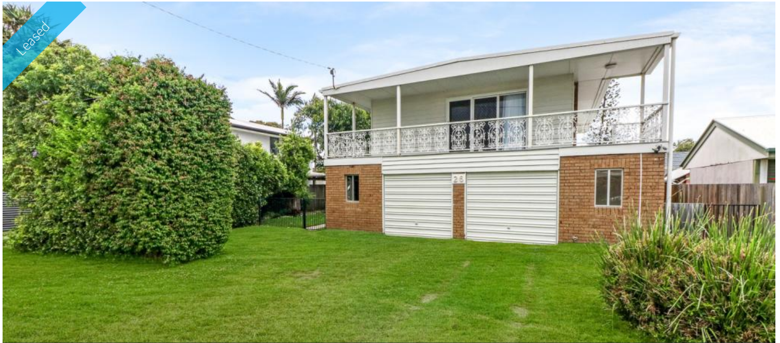
Unit 2, 26 Bauhinia Cres, Marcoola