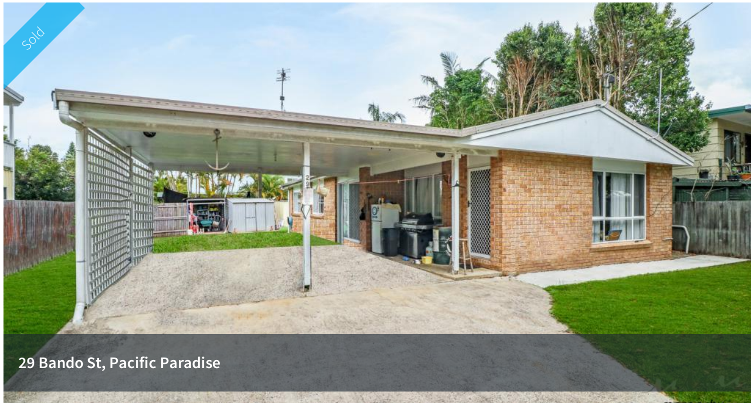
29 Bando St, Pacific Paradise