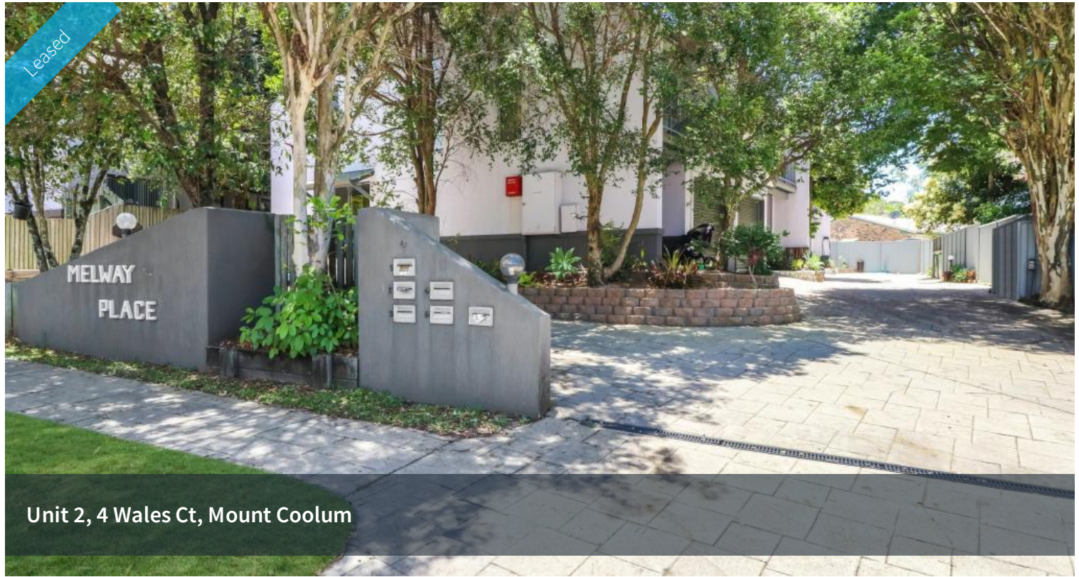
Unit 2, 4 Wales Ct, Mount Coolum