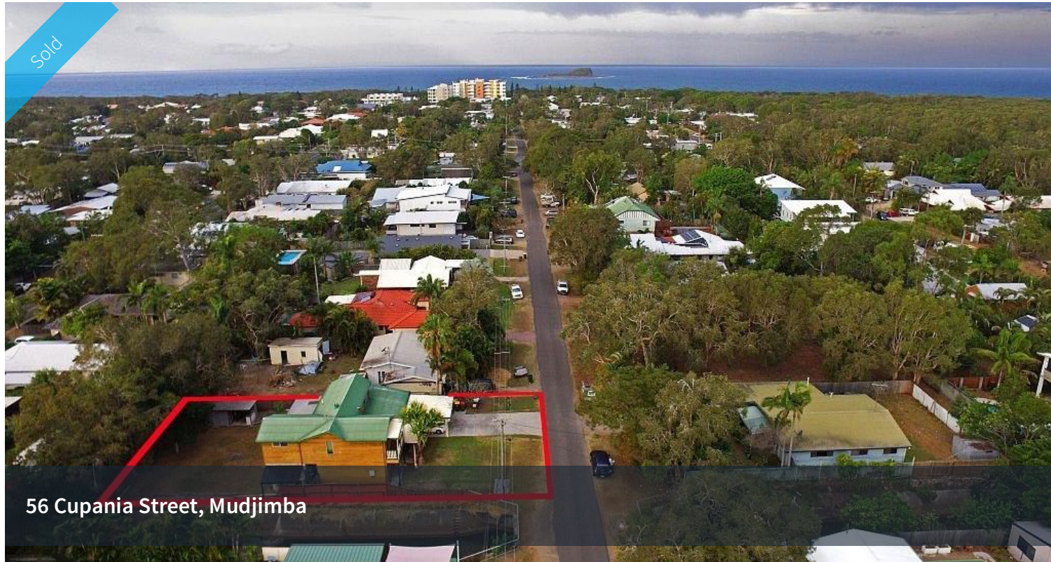
56 Cupania Street, Mudjimba