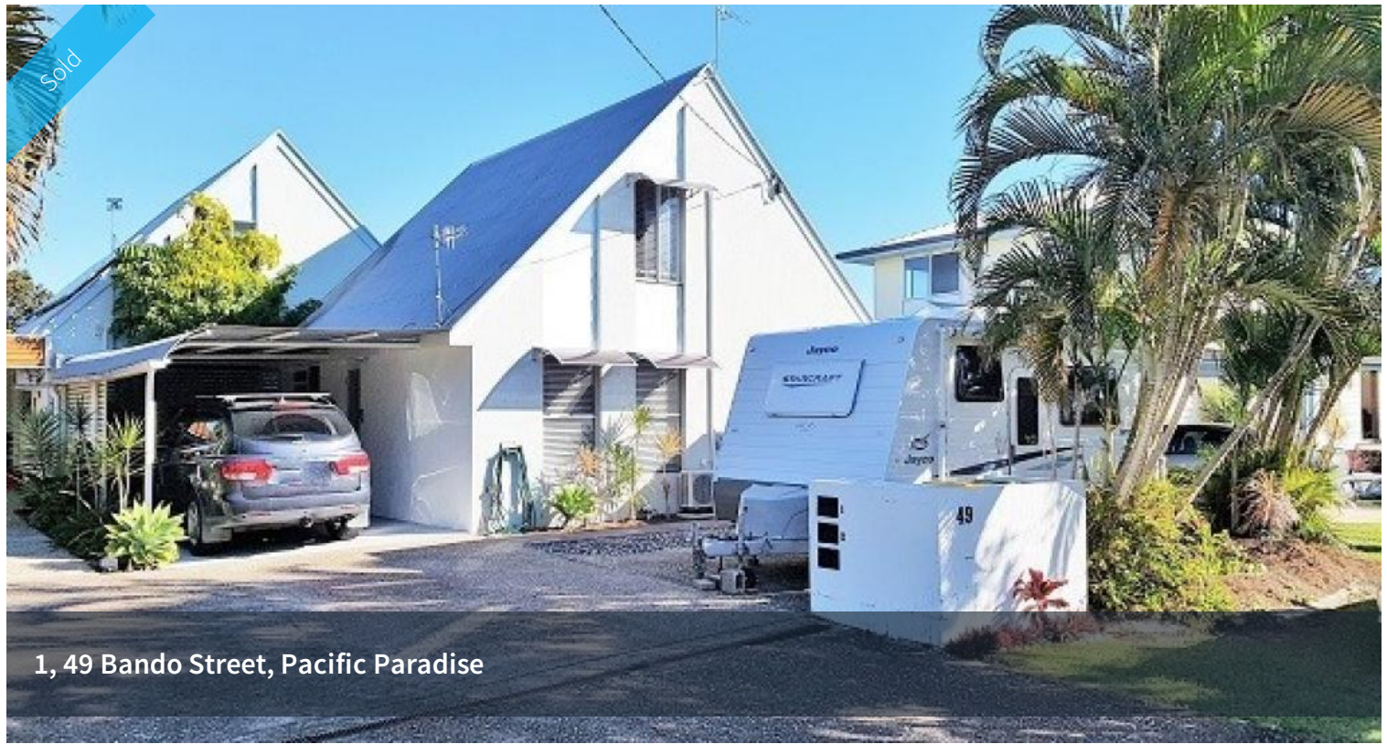
1, 49 Bando Street, Pacific Paradise