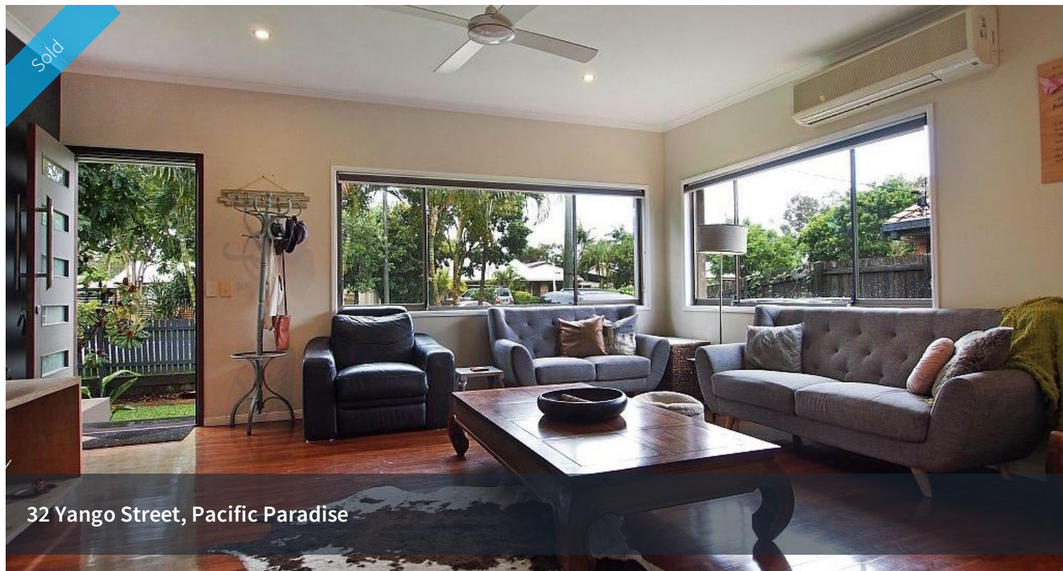
32 Yango Street, Pacific Paradise