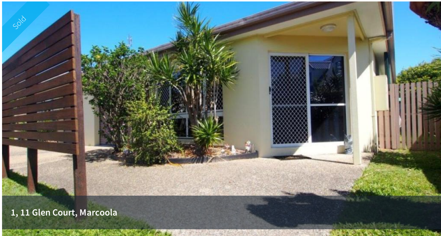
1, 11 Glen Court, Marcoola