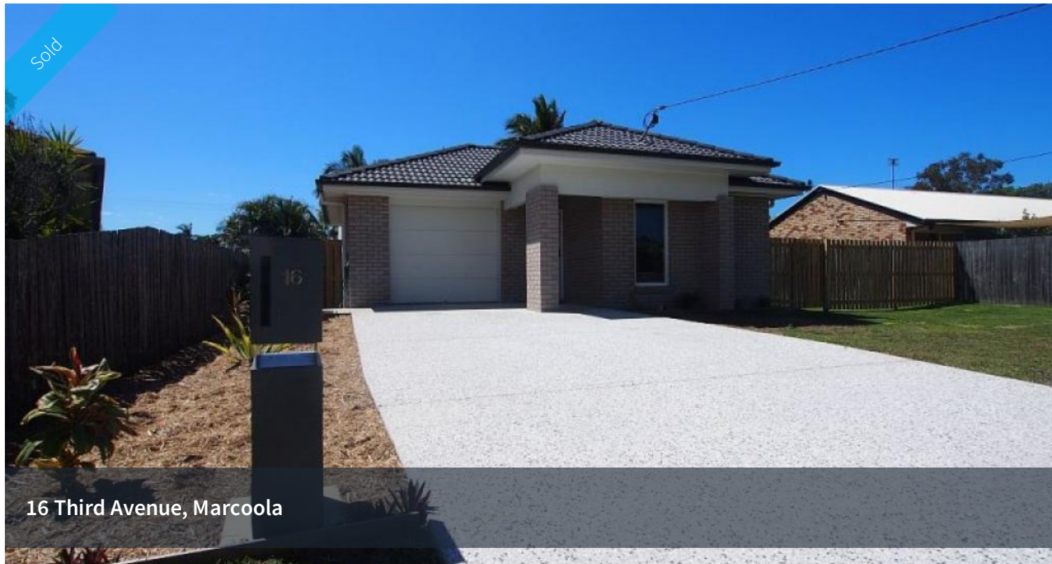
16 Third Avenue, Marcoola