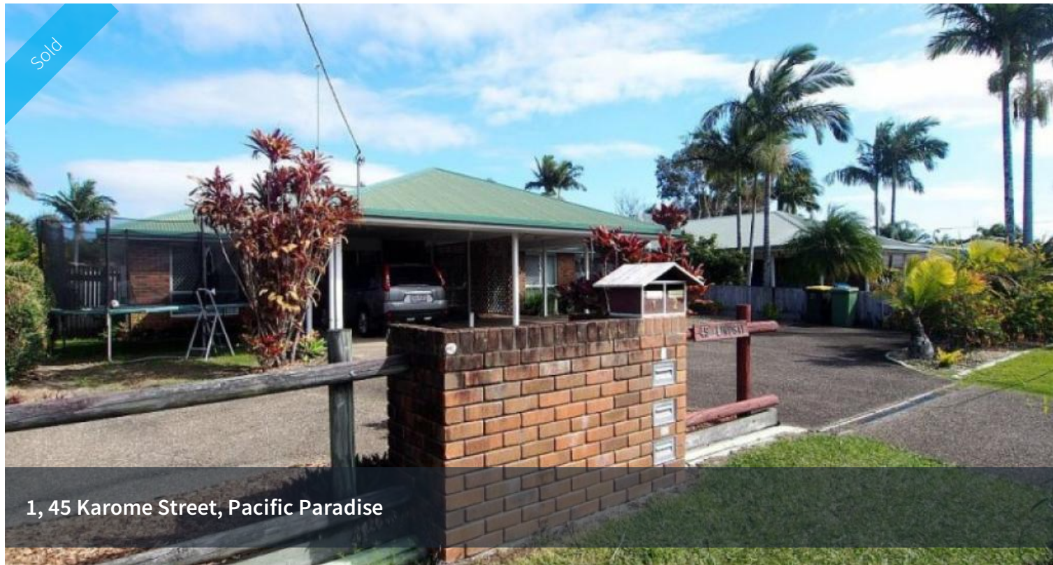
1, 45 Karome Street, Pacific Paradise