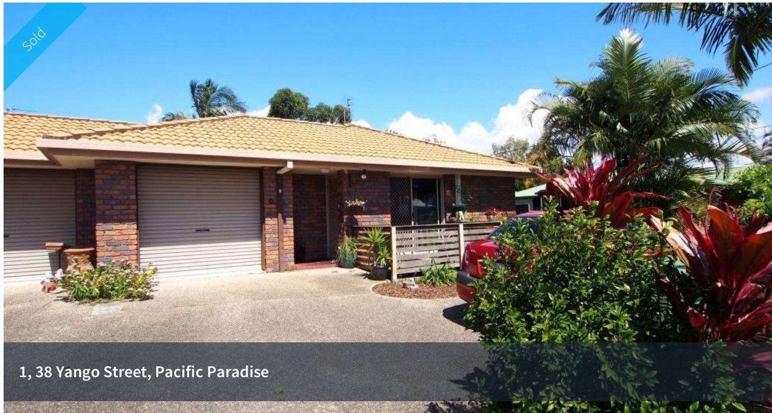
1, 38 Yango Street, Pacific Paradise