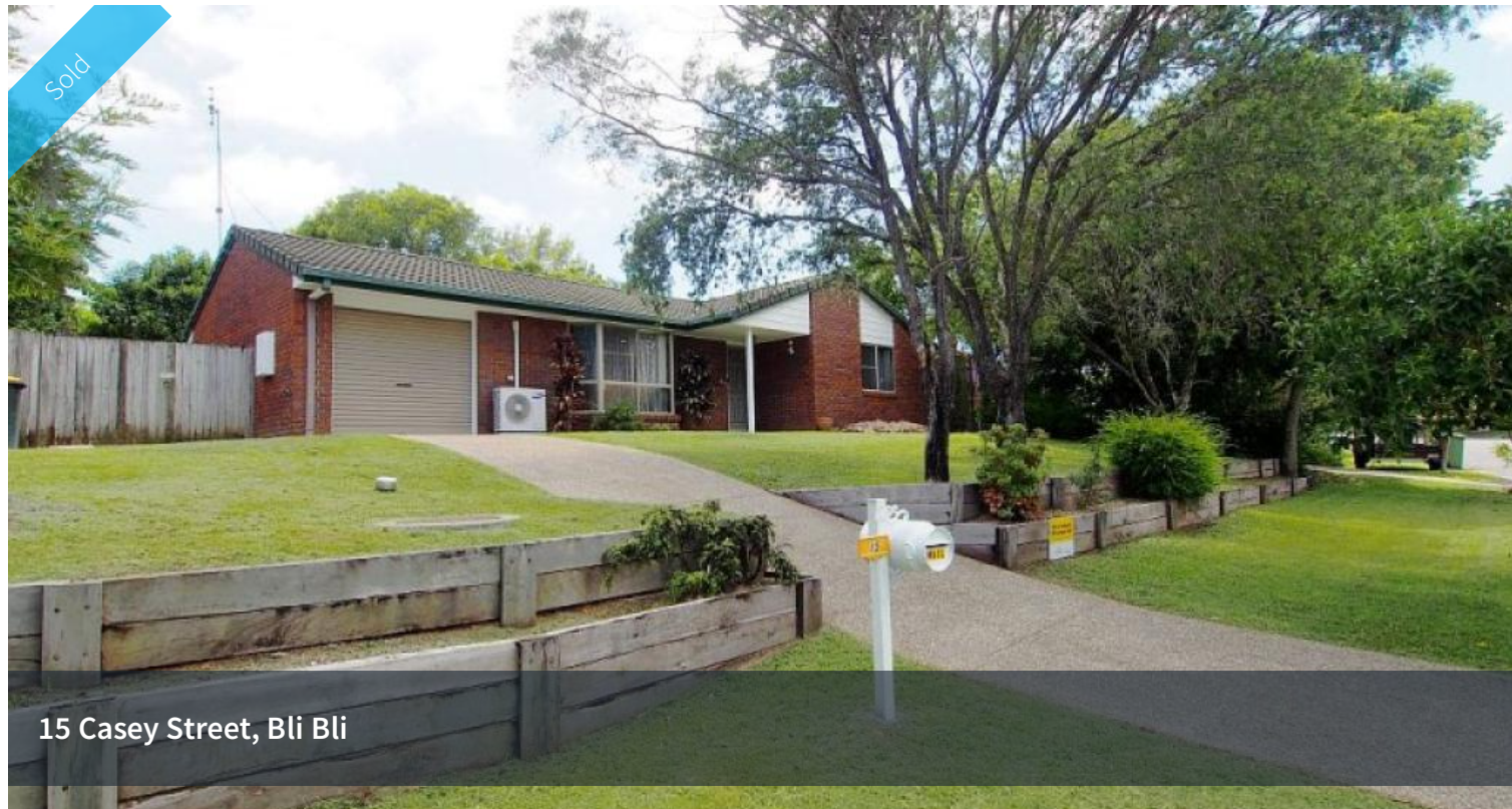
15 Casey Street, Bli Bli