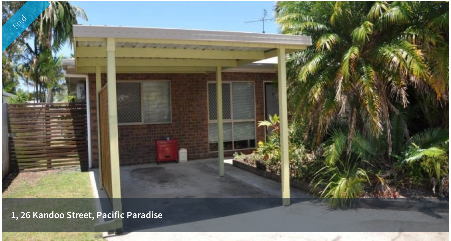
1, 26 Kandoo Street, Pacific Paradise