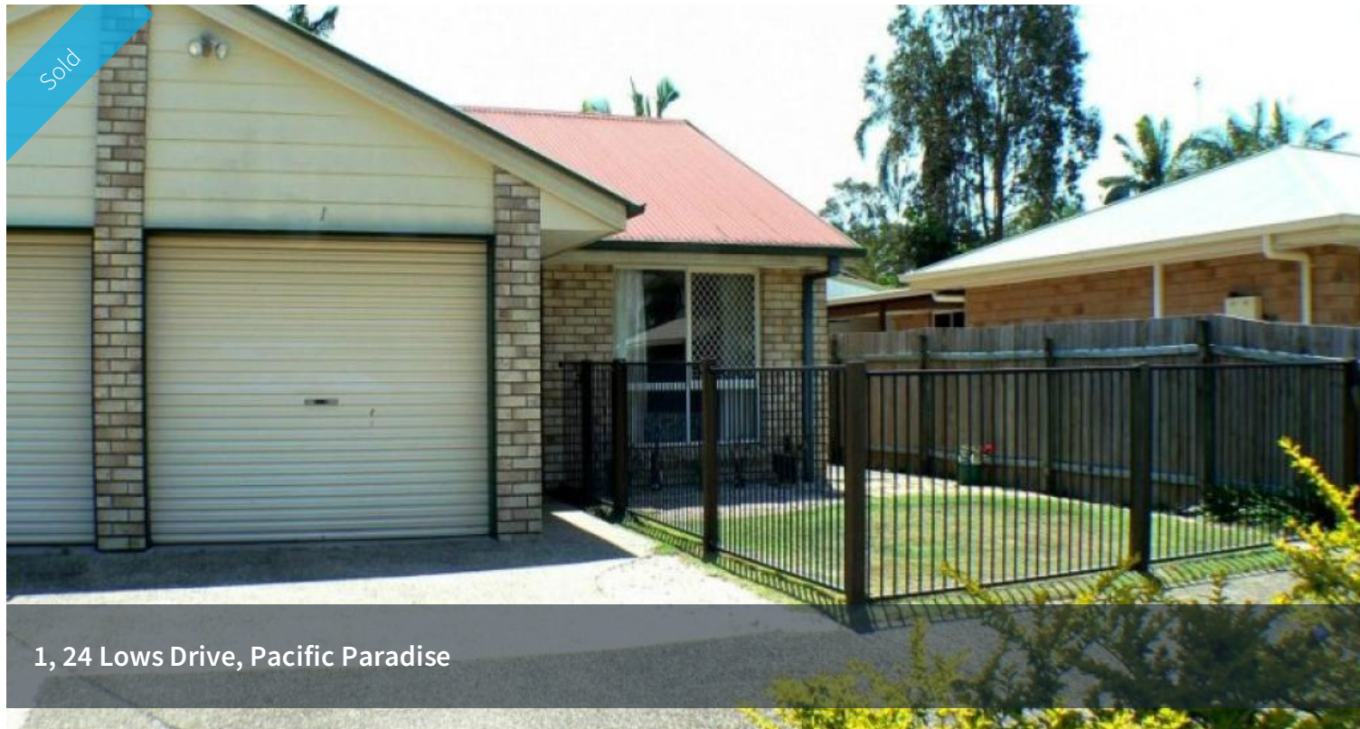
1, 24 Lows Drive, Pacific Paradise