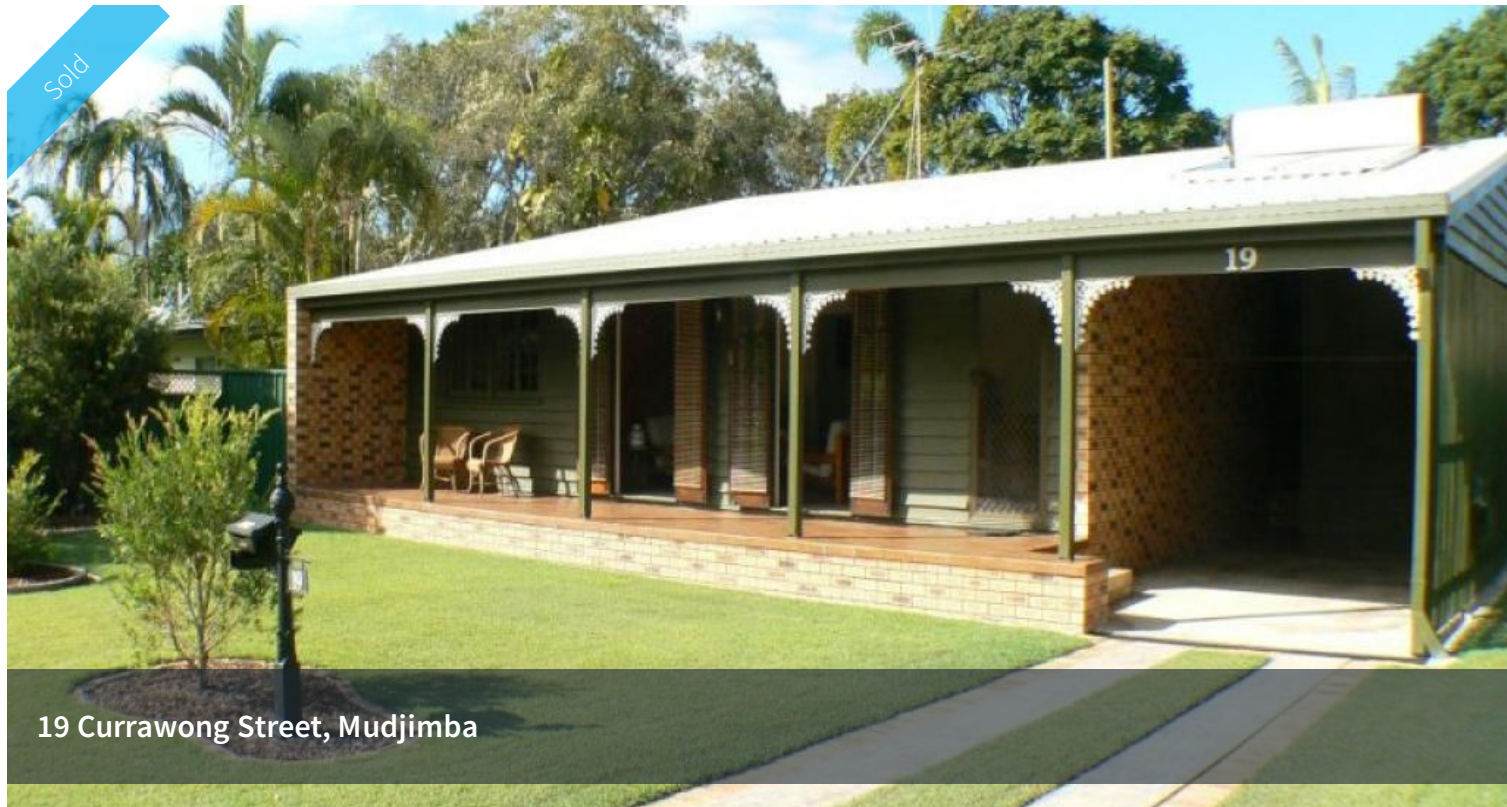
19 Currawong Street, Mudjimba