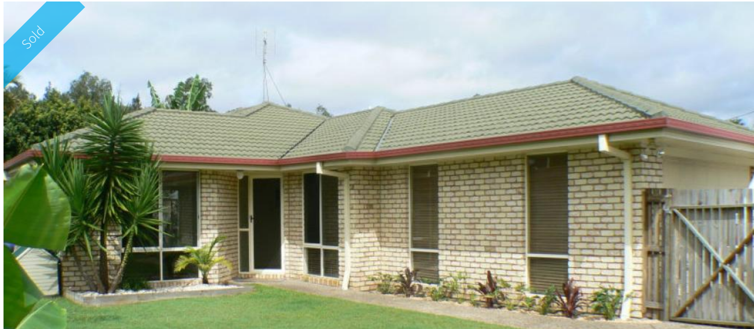
30 Yango St, Pacific Paradise