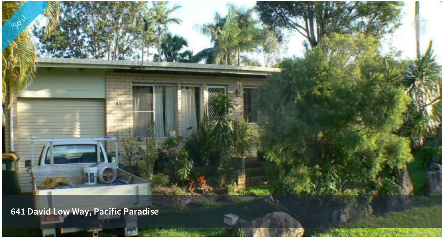
641 David Low Way, Pacific Paradise