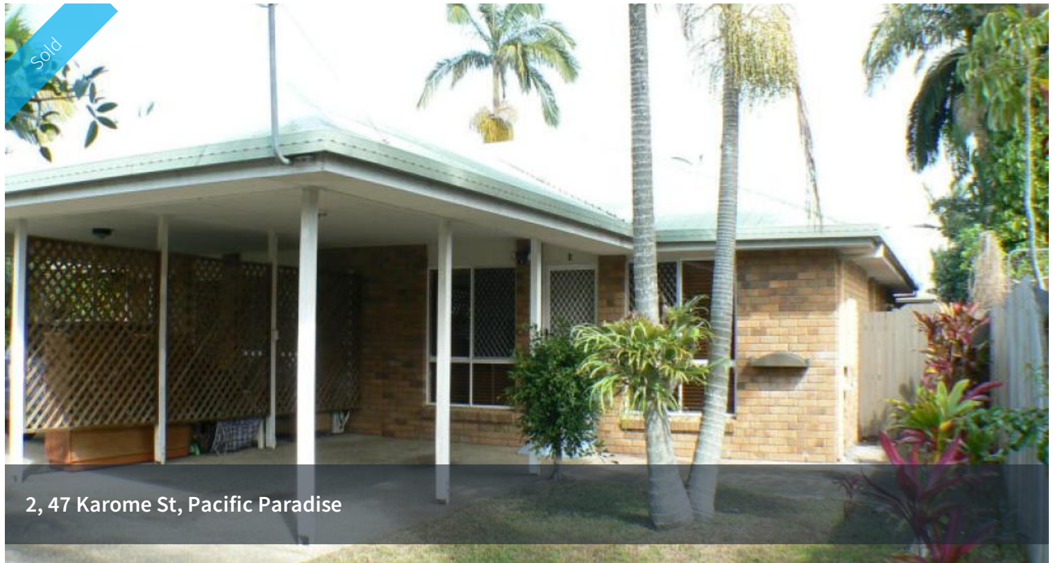
2, 47 Karome St, Pacific Paradise