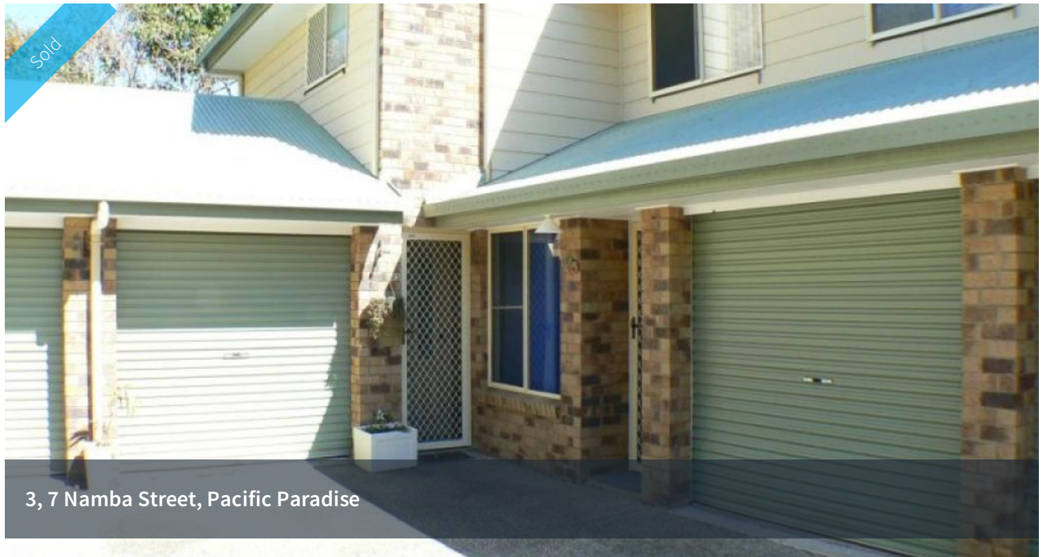
3, 7 Namba Street, Pacific Paradise