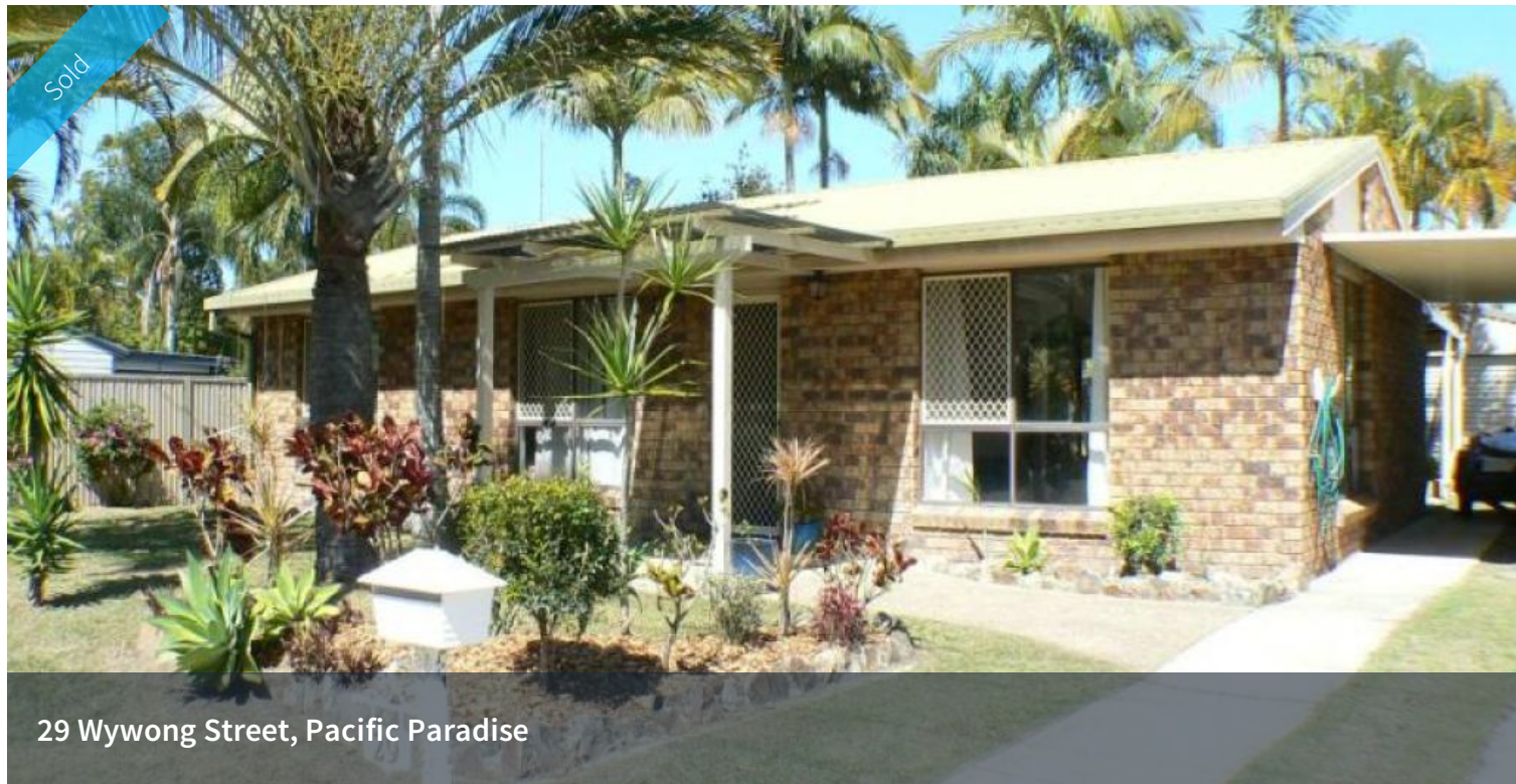
29 Wywong Street, Pacific Paradise