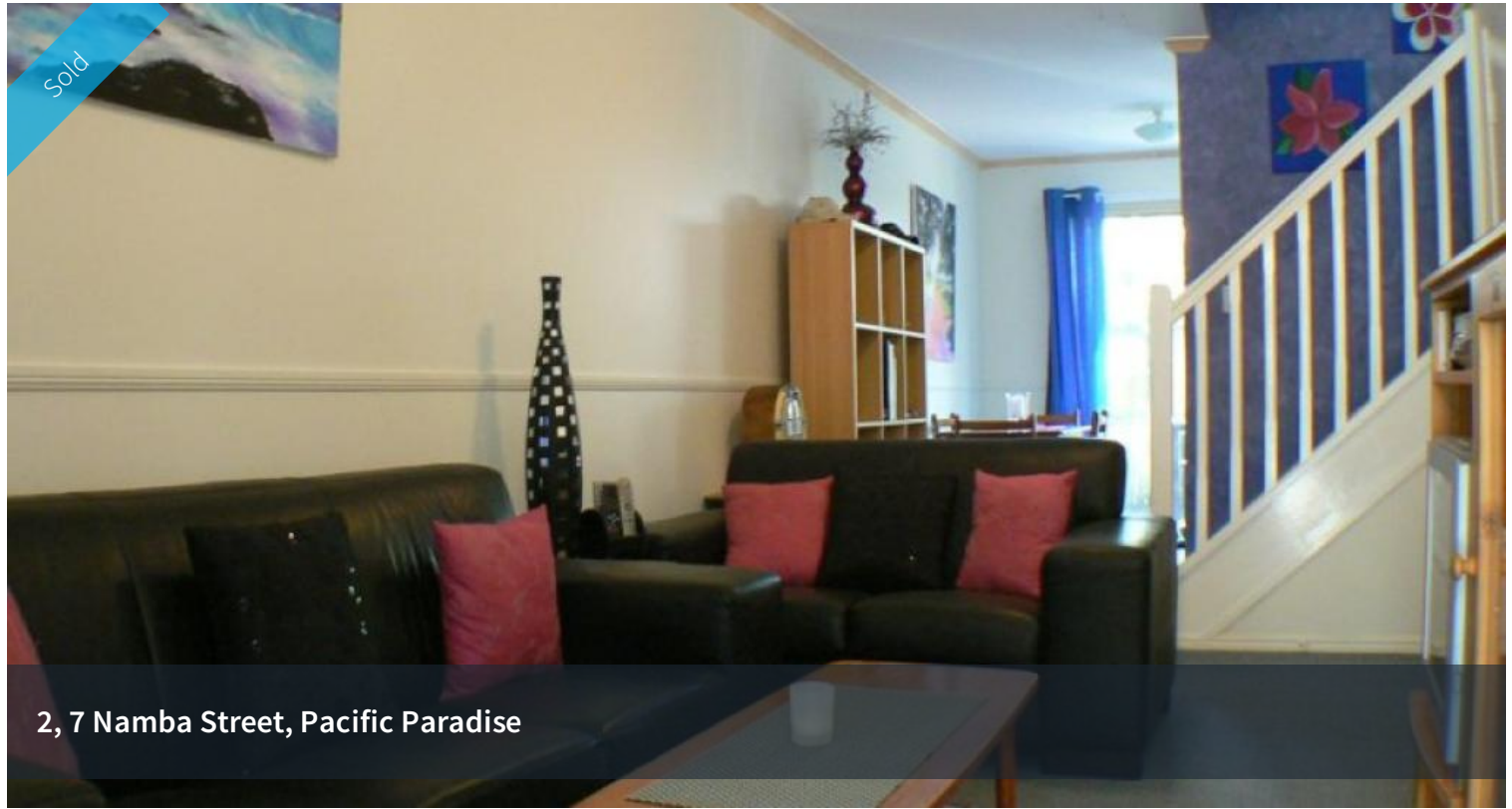
2, 7 Namba Street, Pacific Paradise