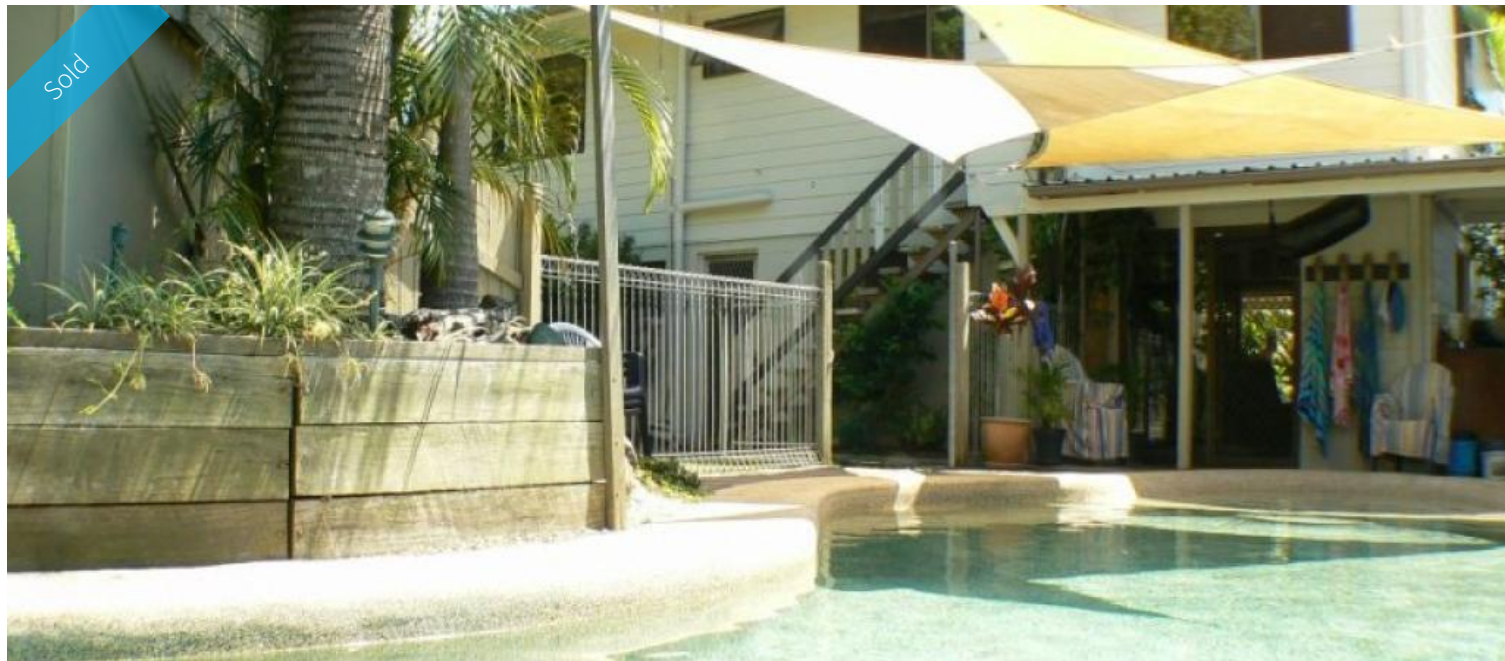
5 Hamia Court, Bli Bli