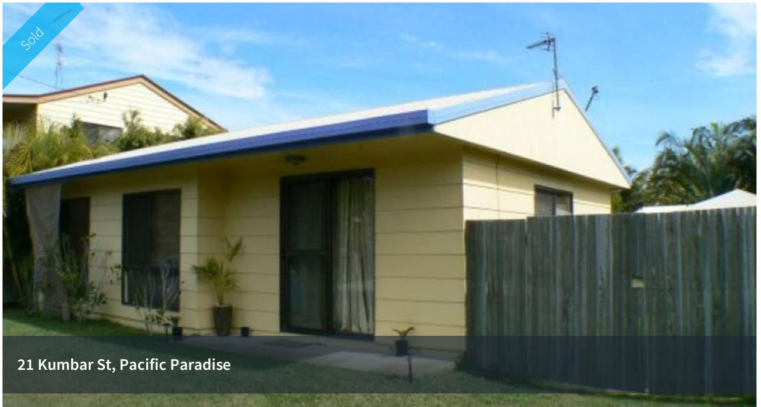
21 Kumbar St, Pacific Paradise