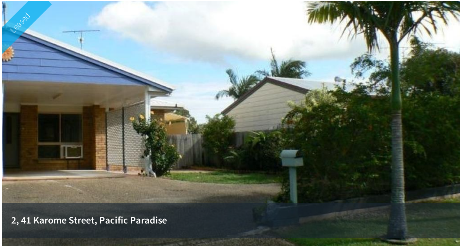
2, 41 Karome Street, Pacific Paradise