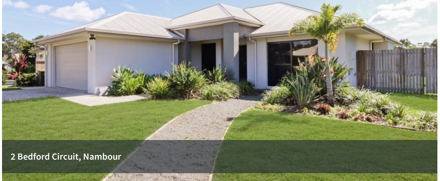
2 Bedford Circuit, Nambour