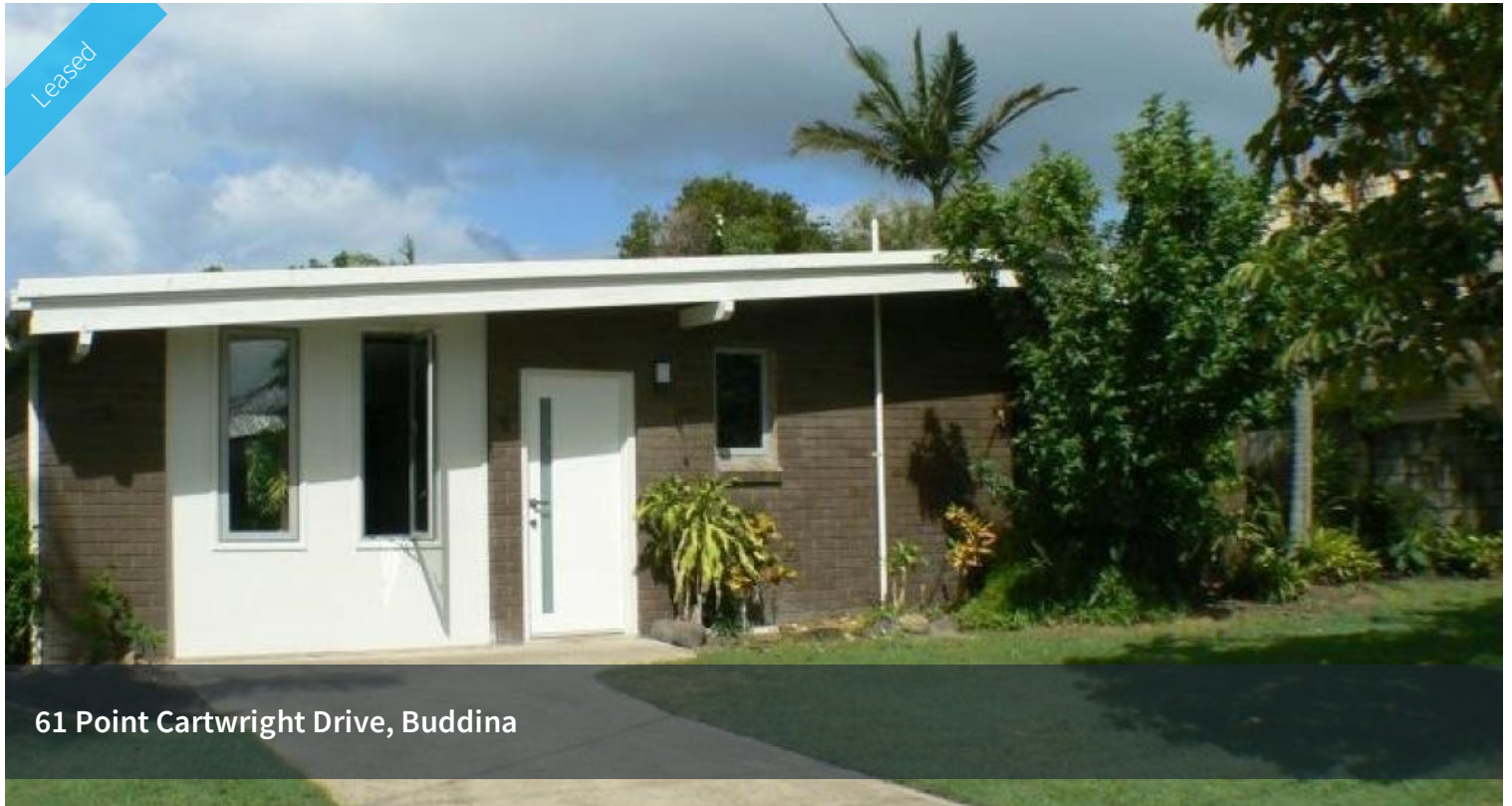
61 Point Cartwright Drive, Buddina