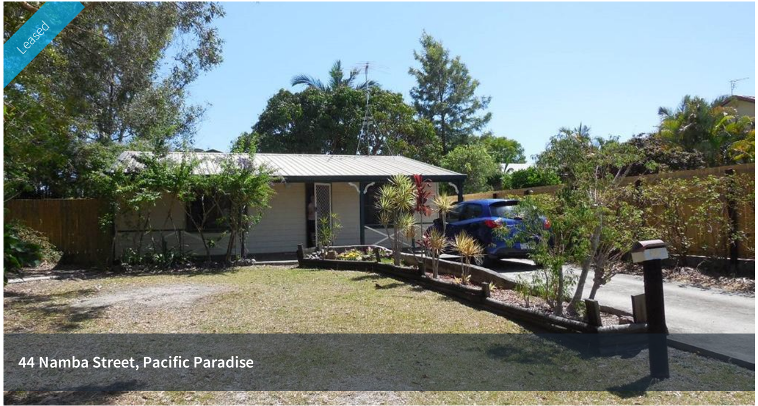
44 Namba Street, Pacific Paradise